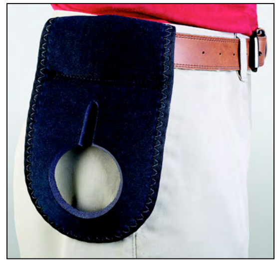
GRASP-IT<sup>™</sup> functions as a third hand to hold a camera at the side