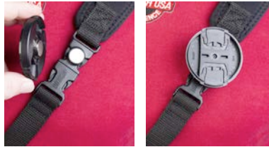
Keep your accessories handy with the System Connector™-Magnetic QD