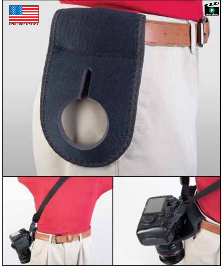
Strap available separately