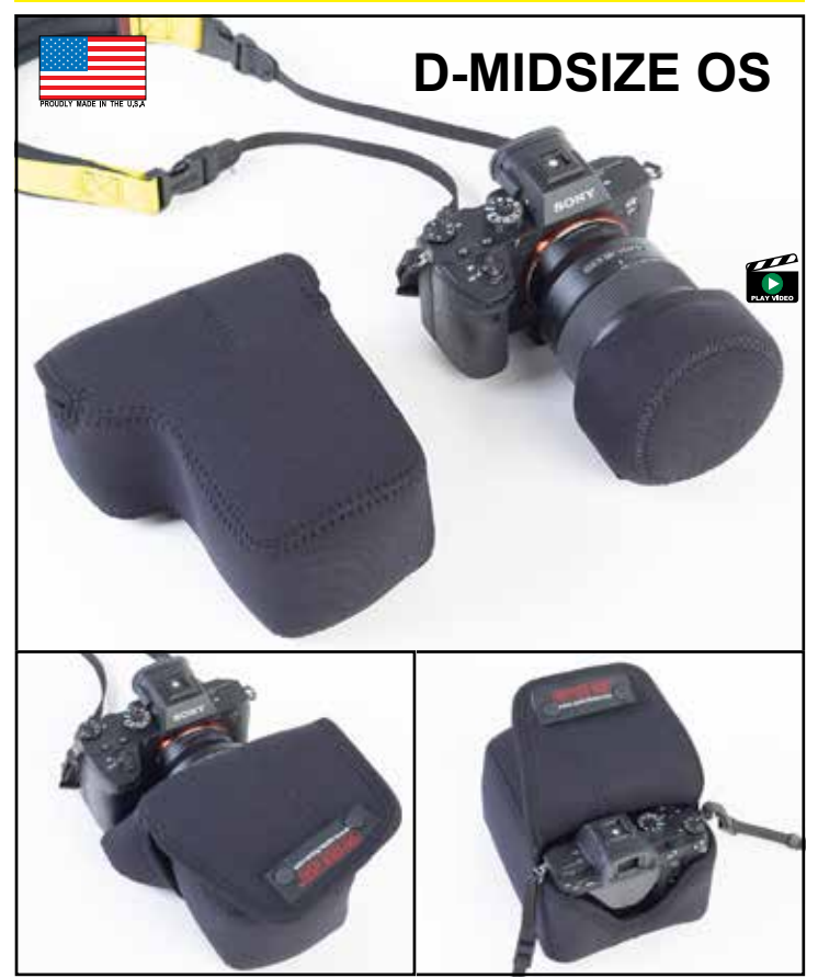
Fits lenses 4" - 5.5" long and up to 4"Ø Envy Strap<sup>™</sup> & Hood Hat<sup>™</sup> available separately